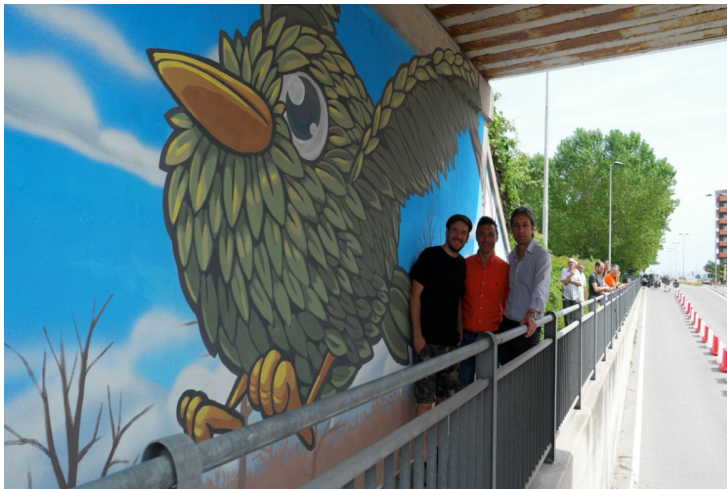
MURALES DI PAO PER "IKEA LOVES HEART"

The Velostation project can be completed through public / private collaboration, as has already happened in other urban regeneration projects (such as, for instance, the provision of urban furniture within roundabouts, underpasses, Green areas ..): this way, private citizens contribute to the realization of the public project, collaborating and sharing the targets.