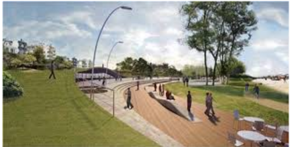
"PARCO DEL MARE"